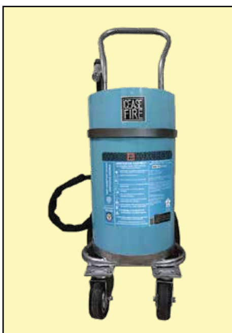
Trolley Mounted 50 Ltrs System