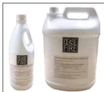
Sodium Hypochlorite 5%