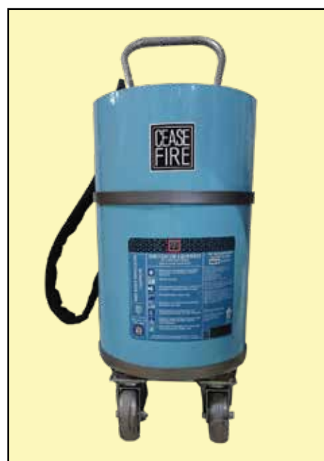
Trolley Mounted 100 Ltrs System