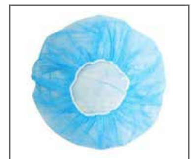
Head Protection Gear (60 pieces)