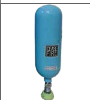
2 ltrs (for 9 ltrs system)