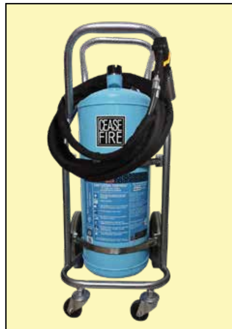
Trolley Mounted 45 Ltrs System