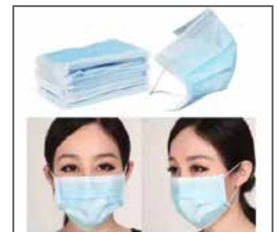
Disposable Mask (60 pieces)