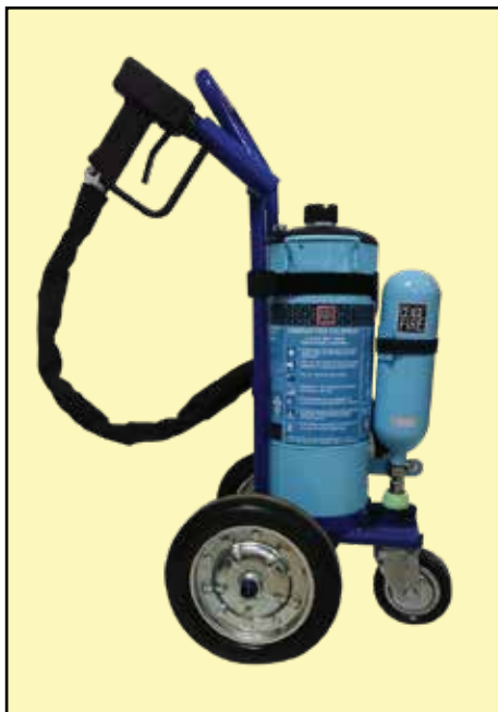
Trolley Mounted 9 Ltrs System