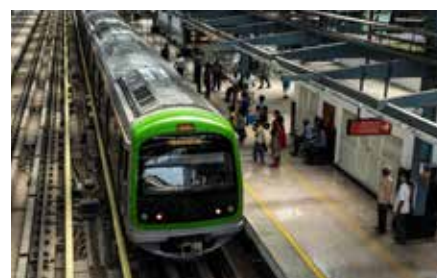
Metro and Railway Coaches & Stations