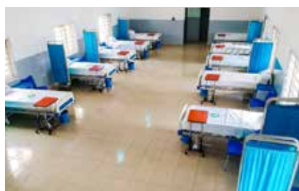
Isolation & Quarantine Centres