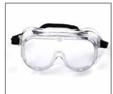
Protective Eyewear (4 pieces)