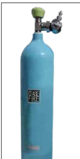
6 ltrs (for 45 ltrs system)