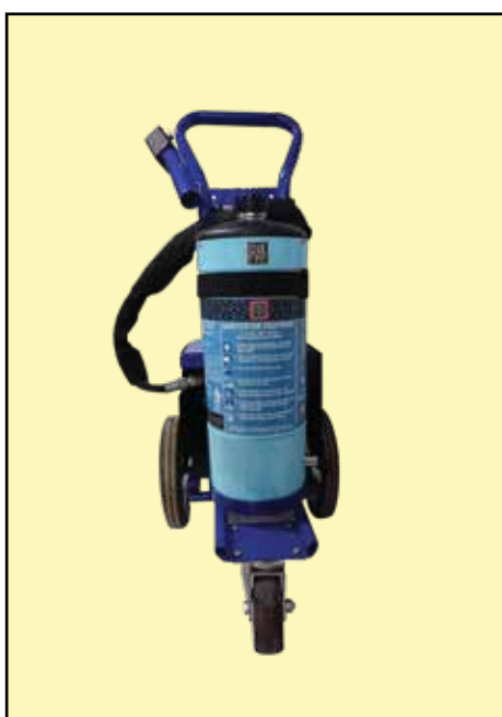
Trolley Mounted 9 Ltrs System