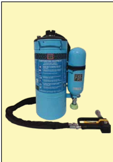
Portable 9 Ltrs System