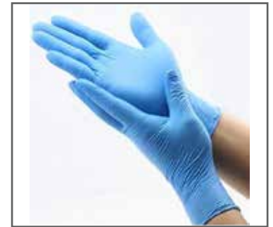
Disposable Gloves (60 pairs)