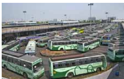
Buses & Bus Stations